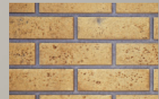
DECORATIVE SANDSTONE BRICK PANELS